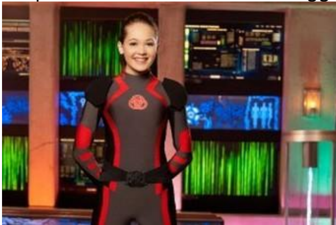
Kelli Berglund was the star of Disney's "Lab Rats."

Thorne as CeCe Jones in a 2011 episode of Disney Channel's "Shake It Up" Modal Trigger