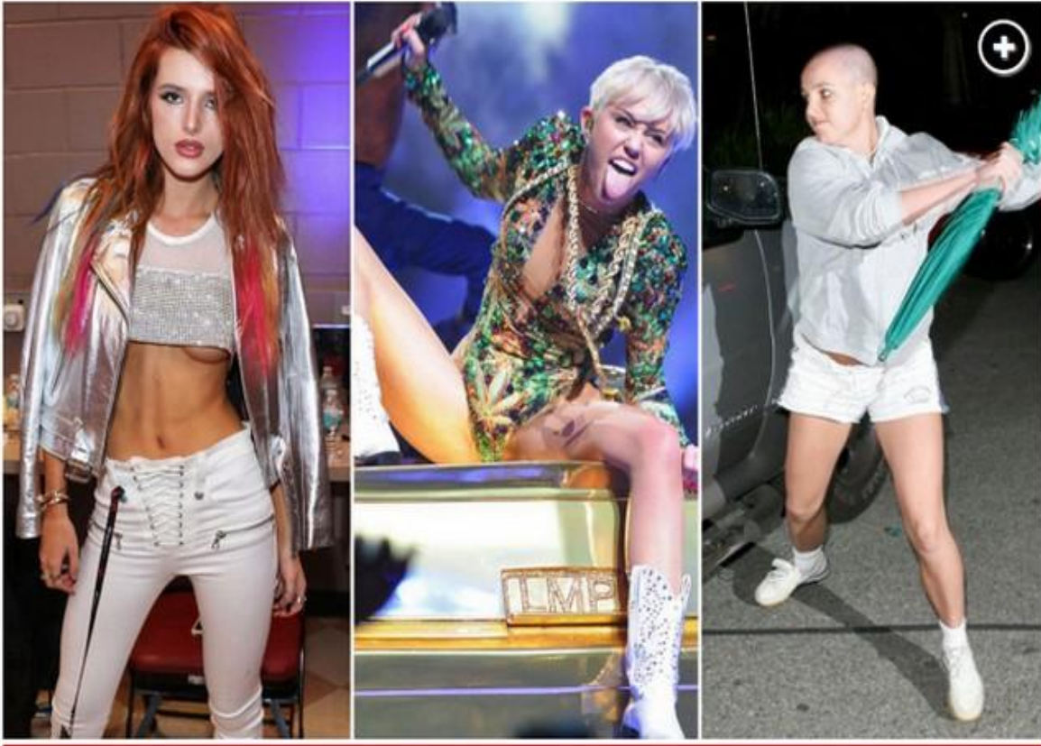
Bella Thorne, Miley Cyrus in 2014 and Britney Spears in 2007.

B ella Thorne, Miley Cyrus in 2014 and Britney Spears in 2007.